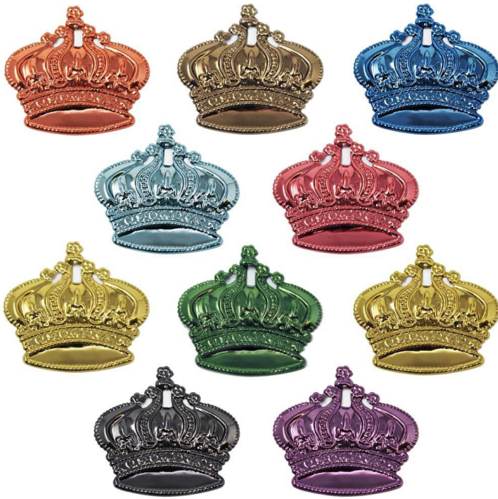
Sample of Post Dyes colors

TechniClear 1100 can be used in conjunction with our Post Dyes and Integral Pigments.