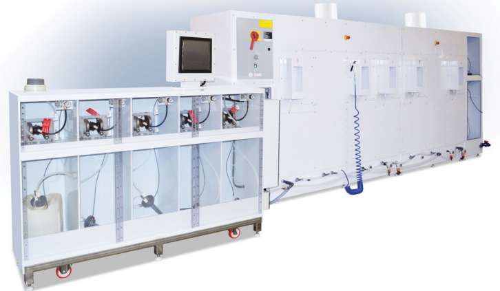
Semcon 2000 back side view with auto dosing and filling station.