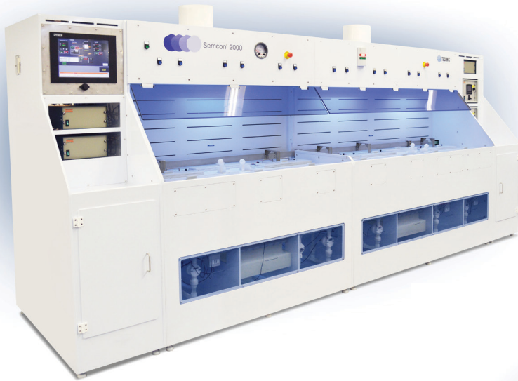
Semcon 2000 with 5 plating stations and associated Pretreat, QDR, and Dragout Rinse stations.