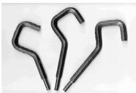
Titanium & Monel Anode Hooks

Bags are the standard sizes for the anode baskets indicated in the bulletin and available in cotton, polypropylene, napped polypropylene or synel. All bags are double stitched with a drawstring closure.